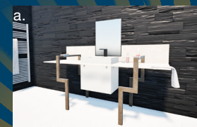
a,b,c,d,e. Students' project works

From 25 to 35 undergraduate or graduate students in Industrial Design, Architecture, Engineering and Applied Arts as well as qualified students in other disciplines with interest in Design. Designers and professionals dealing with industrial Design and Applied Arts are also welcome. Good knowledge of English is required.