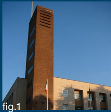
fig.1 University of Bologna, fig.2 Academy of Fine Arts Bologna, fig.3 CeUB Bertinoro, fig.4 Bologna City Center, fig.5 Camplus Bononia, fig.6 Technogym, fig.7 Ferrari Museum, fig.8 Ducati Museum, fig.9 NERI S.p.A.