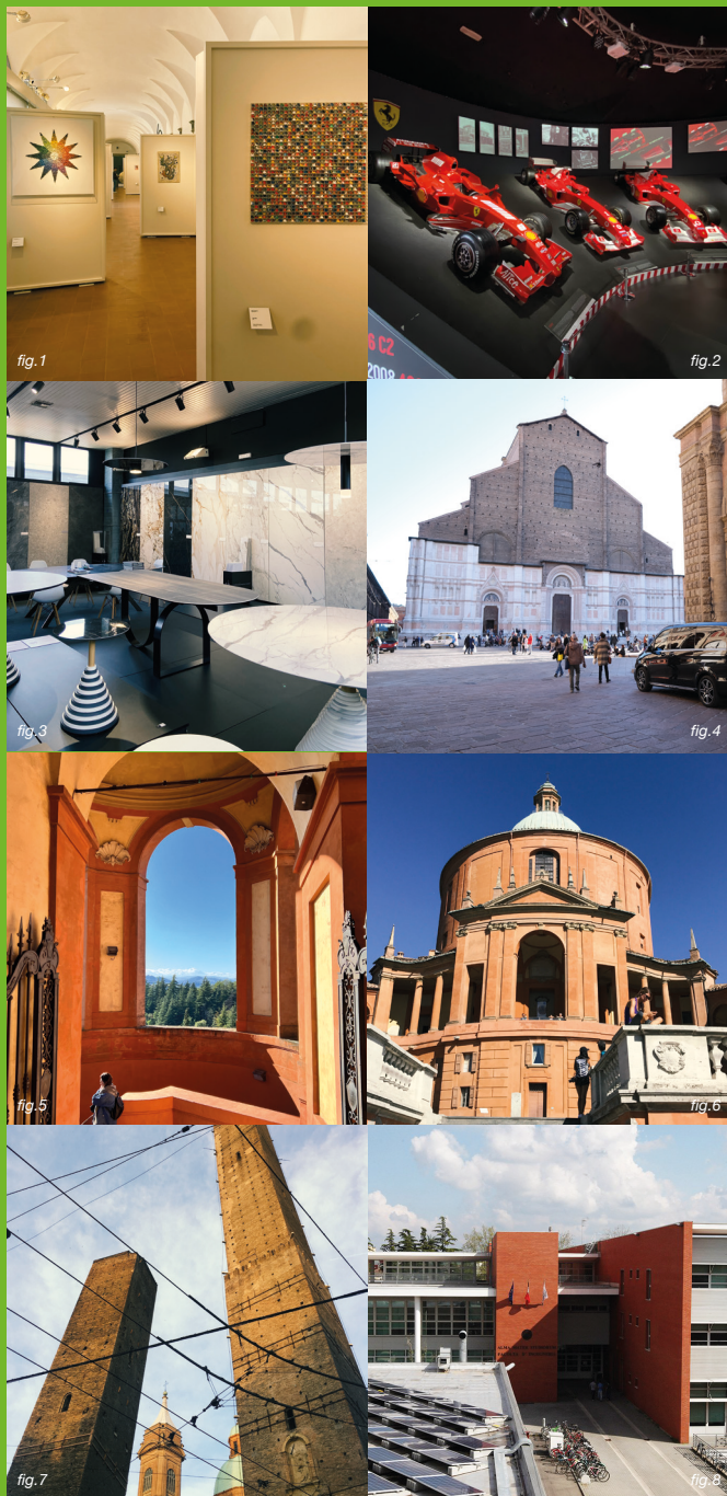
fig.1 International Museum of Ceramics fig.2 Ferrari Museum fig.3 Terza Dimensione company showroom fig.4 Piazza Maggiore